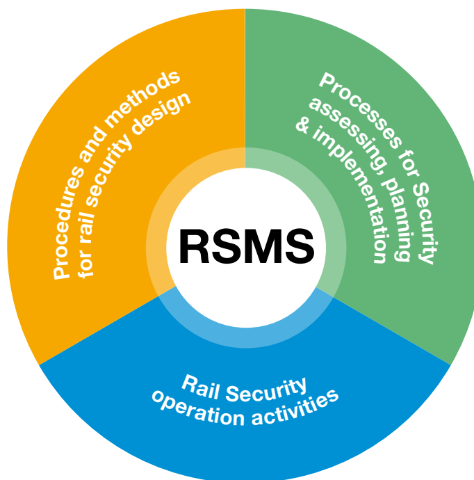
The Railway Security Management System wheel